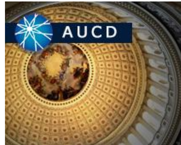
■ In Brief