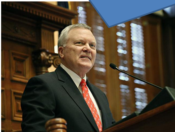
Governor Nathan Deal 2013 Disability Day at the Capitol

I want to commend Kennesaw State University for a program that they have initiated. They are allowing students with disabilities to participate in classes and in educational opportunities along with students who don't have disabilities. They are being a forerunner of this in our higher educational institutions, and I believe it is a program that we can replicate throughout our entire university system.