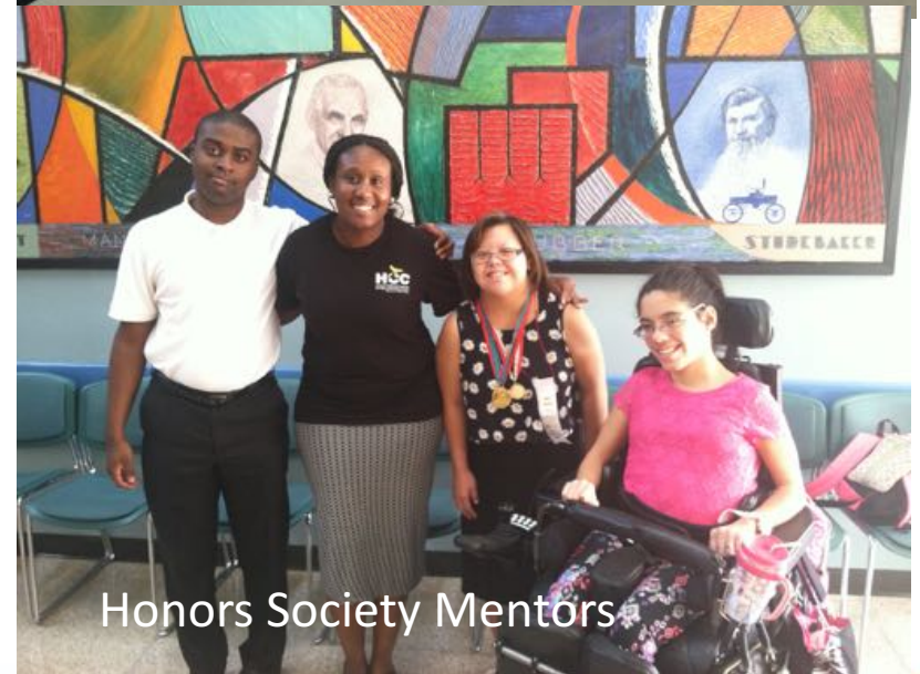
Honors Society Mentors