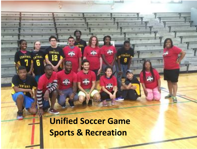
Unified Soccer Game Sports & Recreation