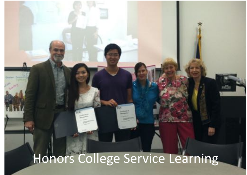
Honors College Service Learning